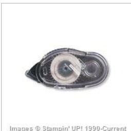
Snail Adhesive - 104332