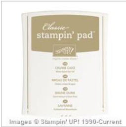
Crumb Cake Classic Stampin' Pad - 126975