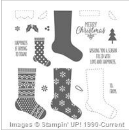
Hang Your Stocking Photopolymer Stamp Set - 142114