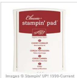
Cherry Cobbler Classic Stampin' Pad - 126966