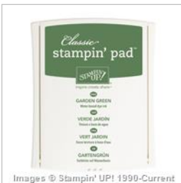
Garden Green Classic Stampin' Pad - 126973