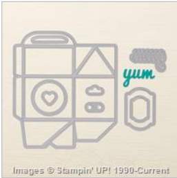
Baker's Box Thinlits Dies - 138279

Marisa Alvarez 847 922-6795 call/text marisa@kitchentablestamper.com marisaalvarez.stampinup.net