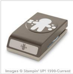
Cookie Cutter Builder Punch - 140396