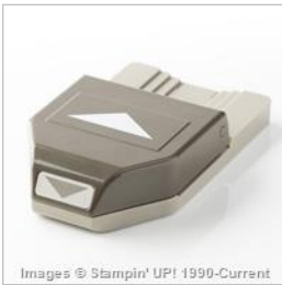
Banner Triple Punch - 138292