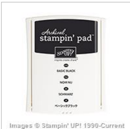
Basic Black Archival Stampin' Pad - 140931