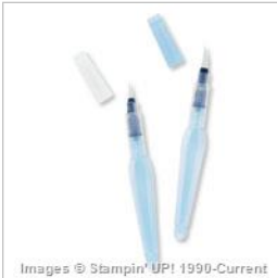
Aqua Painters - 103954