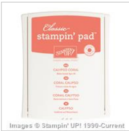
Calypso Coral Classic Stampin' Pad - 126983