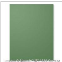
Garden Green 8-1/2" X 11" Cardstock - 102584