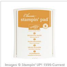
Delightful Dijon Classic Stampin' Pad - 138327