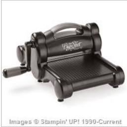
Big Shot - 143263