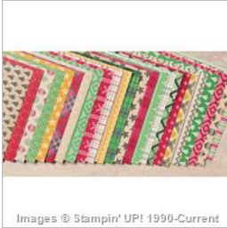
Warmth & Cheer Designer Series Paper Stack - 141991