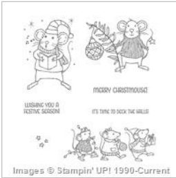
Merry Mice Clear-Mount Stamp Set - 142145