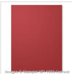
Cherry Cobbler 8-1/2" X 11" Cardstock - 119685